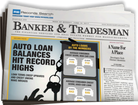
NENPA Newspaper of Distinction

Every issue features a weekly review of the hottest topics from our daily web coverage. Regular features also include By The Numbers, a collection of information and developments for a selection of Massachusetts counties and towns, and the renowned Records section, which is the leading source of information for real estate and mortgage transactions in the state, including foreclosure deeds, credit defaults, and probate court transactions.